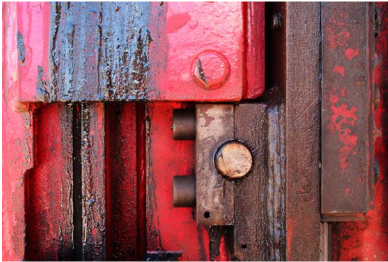
Equipment grease removal and cleaning

The SC Series is a high output hot mobile wash skid with serious cleaning power. It was designed to withstand the daily use by professionals who rely on its dependability to make a living. Its high impact power enables it to handle just about any size cleaning task with ease and without the need for an outside power source. If portability is needed add a wheel kit or mount on a trailer, truck bed or tank skid. Equipped with a heavy-duty diesel engine and V-belt driven pump this machine delivers exceptional water flow and high pressure creating a powerful and efficient cleaning system. The 12v diesel fired burner, adjustable temperature and large capacity fuel tank provide extended run times for a variety of applications.