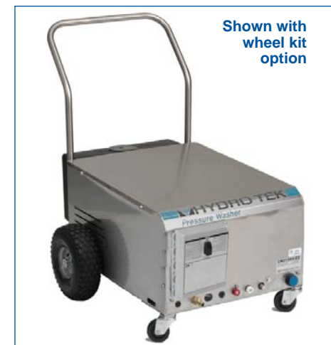
Shown with wheel kit option

HYDRO TEK .US CLEANING EQUIPMENT MFG. 2353 Almond Avenue Redlands CA 92374 800.274.9376 fx909.799.9888 www.hydrotek.us